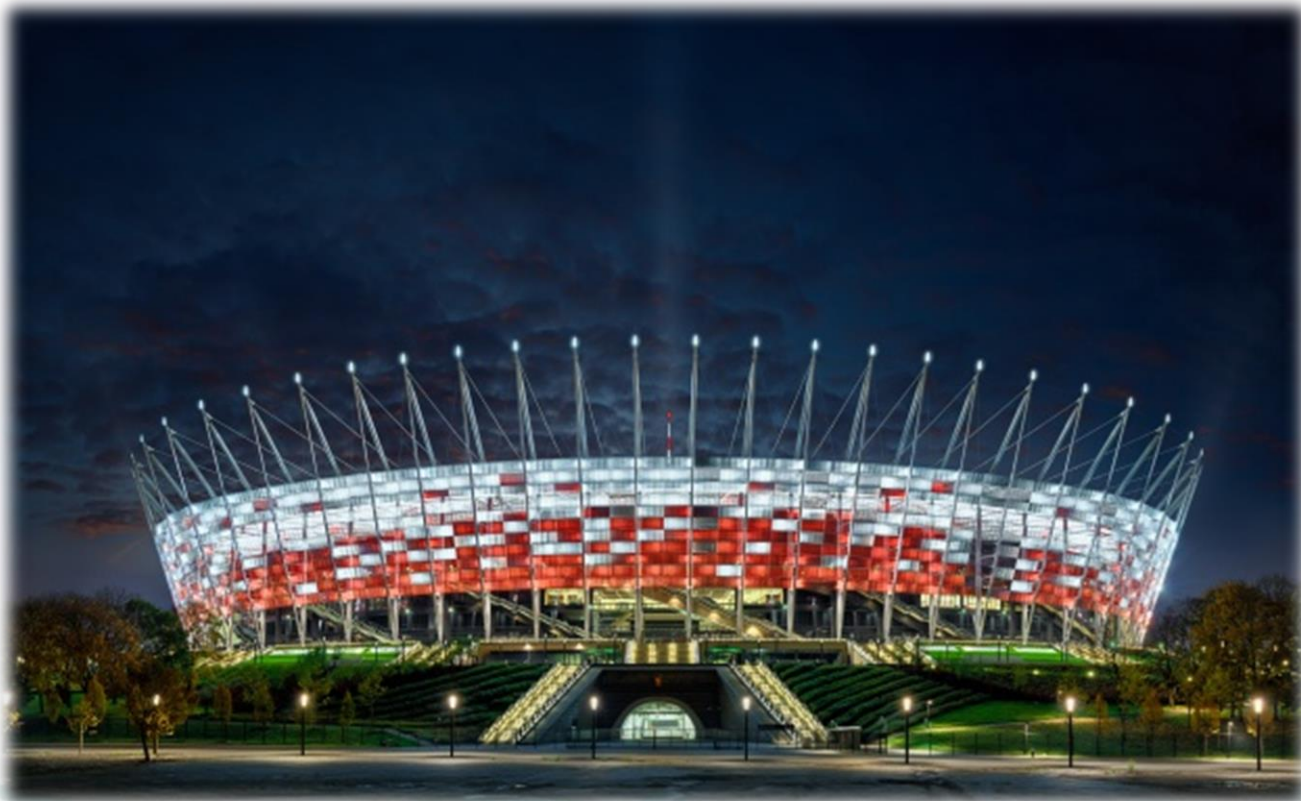
Fot. National Stadium in Warsaw