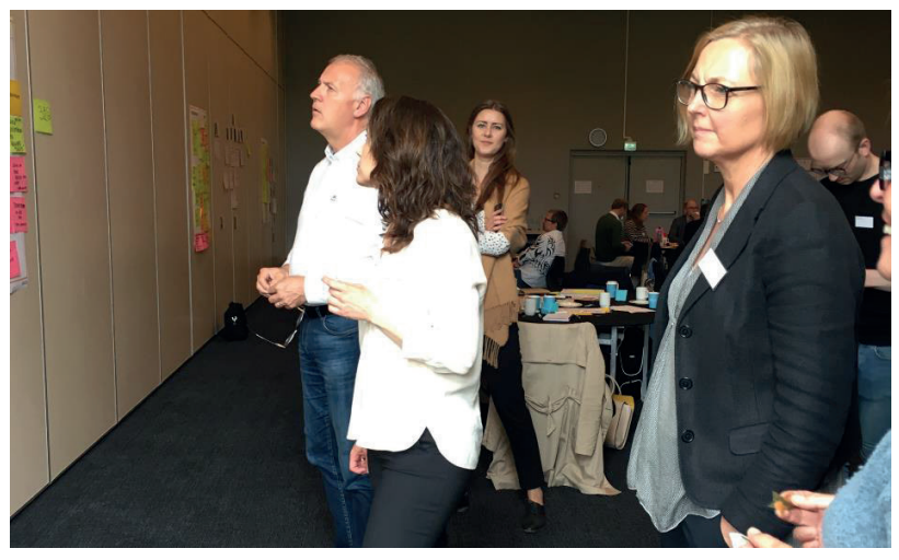
Preparing for an innovation partnership-suppliers and procurer in dialogue

The procurement procedure innovation partnership was introduced in Norway's national legislation in January 2017. Since then, 8-10 innovation partnership projects are started.