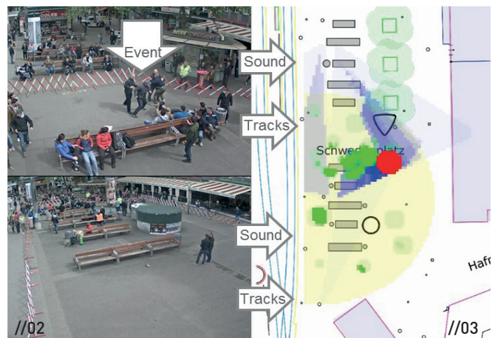
Green: Presence Map // Blue: Sound Intensity Map // Red: Alarm