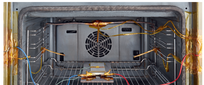
//01 Thermal Tests