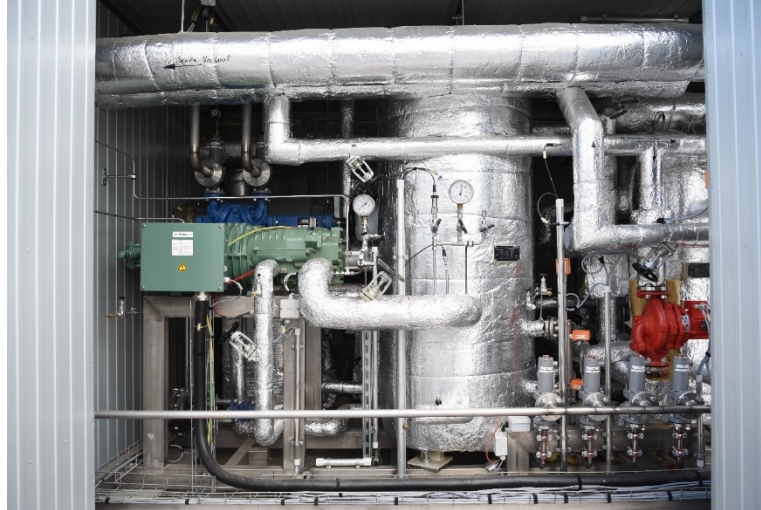
BU: DryFiciency high-temperature heat pumps were commissioned in three applications and tested in an industrial environment. Plant at AGRANA Stärke in Pischelsdorf.