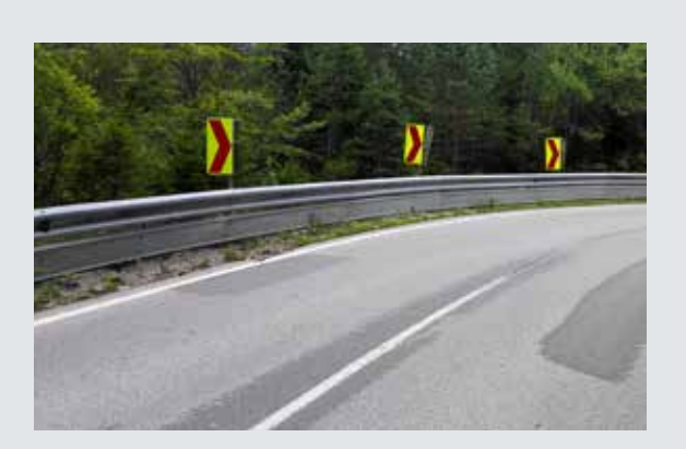
RISKANT: The RISKANT project included evaluating measures to secure stationary objects.

Thanks to our accurate and extensive analyses and evaluation of measures, you know exactly where the dangerous spots in your road network are and what precautions you need to take to increase road safety.